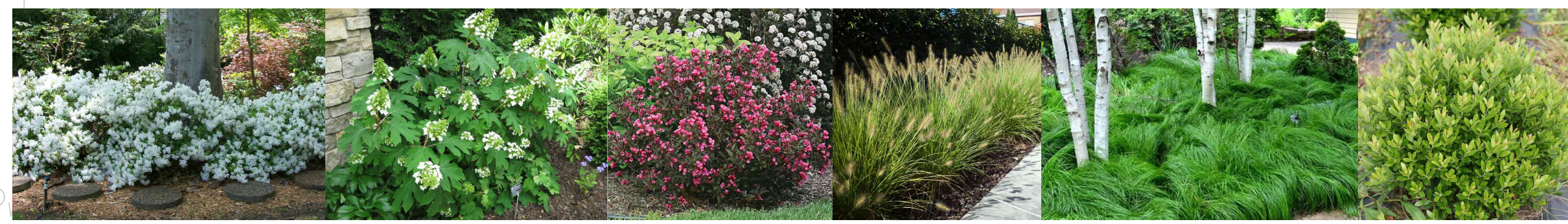
Rhodo 'Delaware Valley White' Hydrangea quercifolia Weigela florida 'Wine and Roses' Pennisetum alopecuroides 'Hameln' Carex pensylvanica Ilex glabra