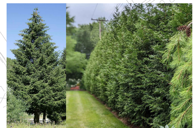
Picea abies Thuja plicata 'Green Giant'