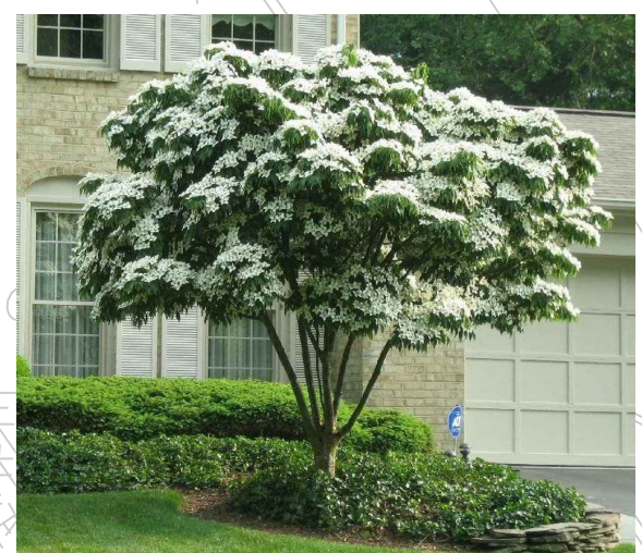
Cornus kousa 'Milky Way'