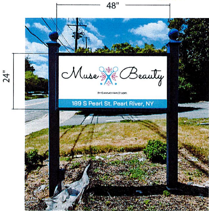
Post Monument Light Box Double Sided Same Artwork Both Sides