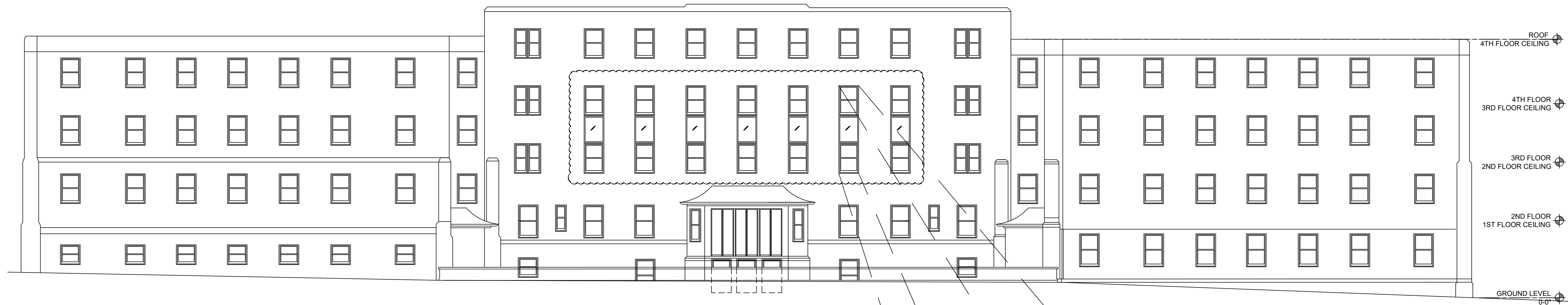
1 FRONT ELEVATION SCALE: 1/8" = 1'-0"